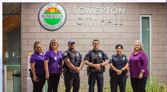
#PurpleThursday2022 City of Somerton Yuma County