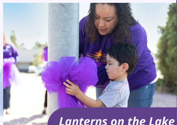
Lanterns on the Lake Time Out Shelter Gila County